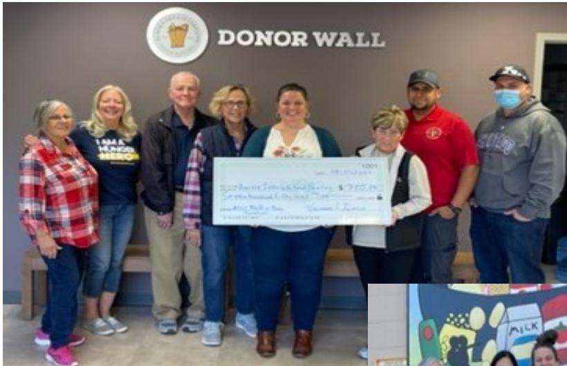
Aurora Area Interfaith Food Pantry (left) and Marie Wilkenson Food Pantry (below)