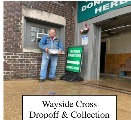
Wayside Cross Dropoff & Collection